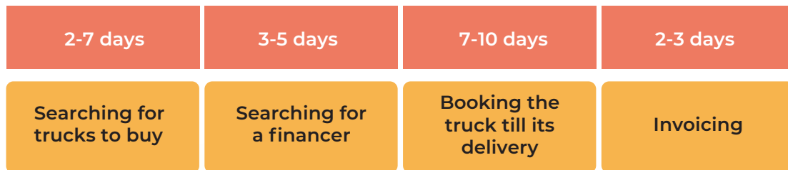
The purchase process for an HCV in India